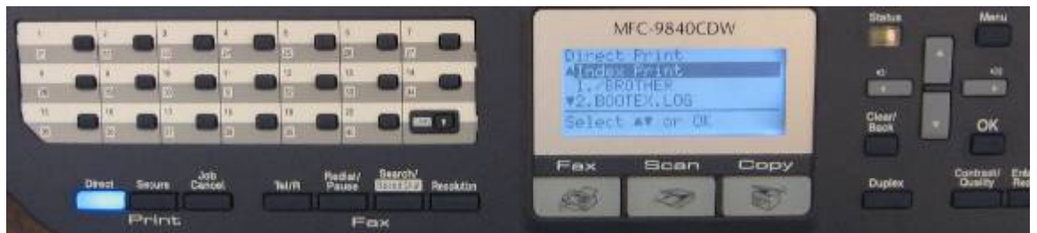
Flatbed control panel

Once the USB Flash Memory Drive has been inserted, the display will change to light up (on printer version it will change to orange) and show the first file or folder which is saved to it. The direct print button will also change to blue (as illustrated below in both images). To find the file you want to print, simply use the 'up' & 'down' keys to select the file and press OK. If the file is in a folder, press the 'OK' button when you see the folder name and it will open. Use the 'back' button on printers and clear/back on the flatbeds if you want to come out of the folder. If you cannot remember the file name, you can print an 'index print', which will print a page of thumbnail images so you can quickly identify the document you are looking for.