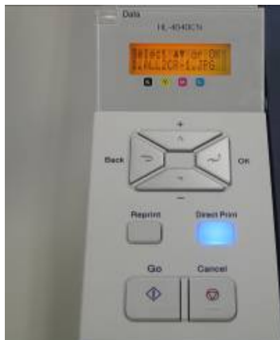
Printer control panel