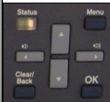
Flatbed control panel