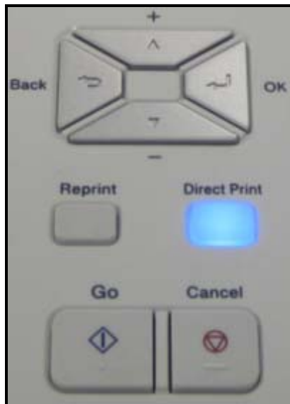
Printer control panel

Use the '+' & '-' keys to navigate between these options, pressing 'OK' to confirm or 'back' to cancel. When you are happy with the printer options selected, press 'Go' and select the number of copies you want to print. If you do not specify any settings, the defaults will be used.